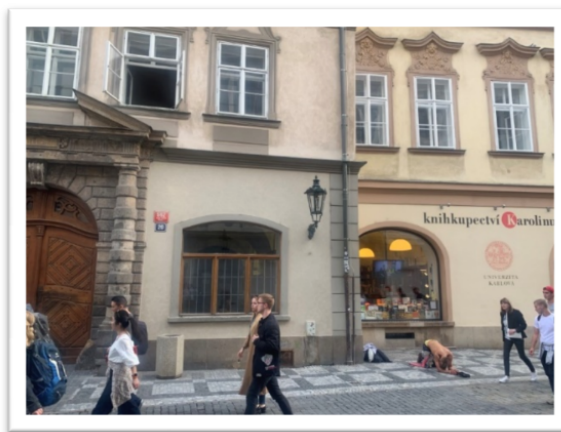
Celetna 562/20 (entrance)

We recommend you finding accommodation in the city centre (Praha 1) but if you couldn't find anything ok for you don't worry the public transportation system works very well in Prague. Here is the link where you can check it on the website: https://www.dpp.cz/en